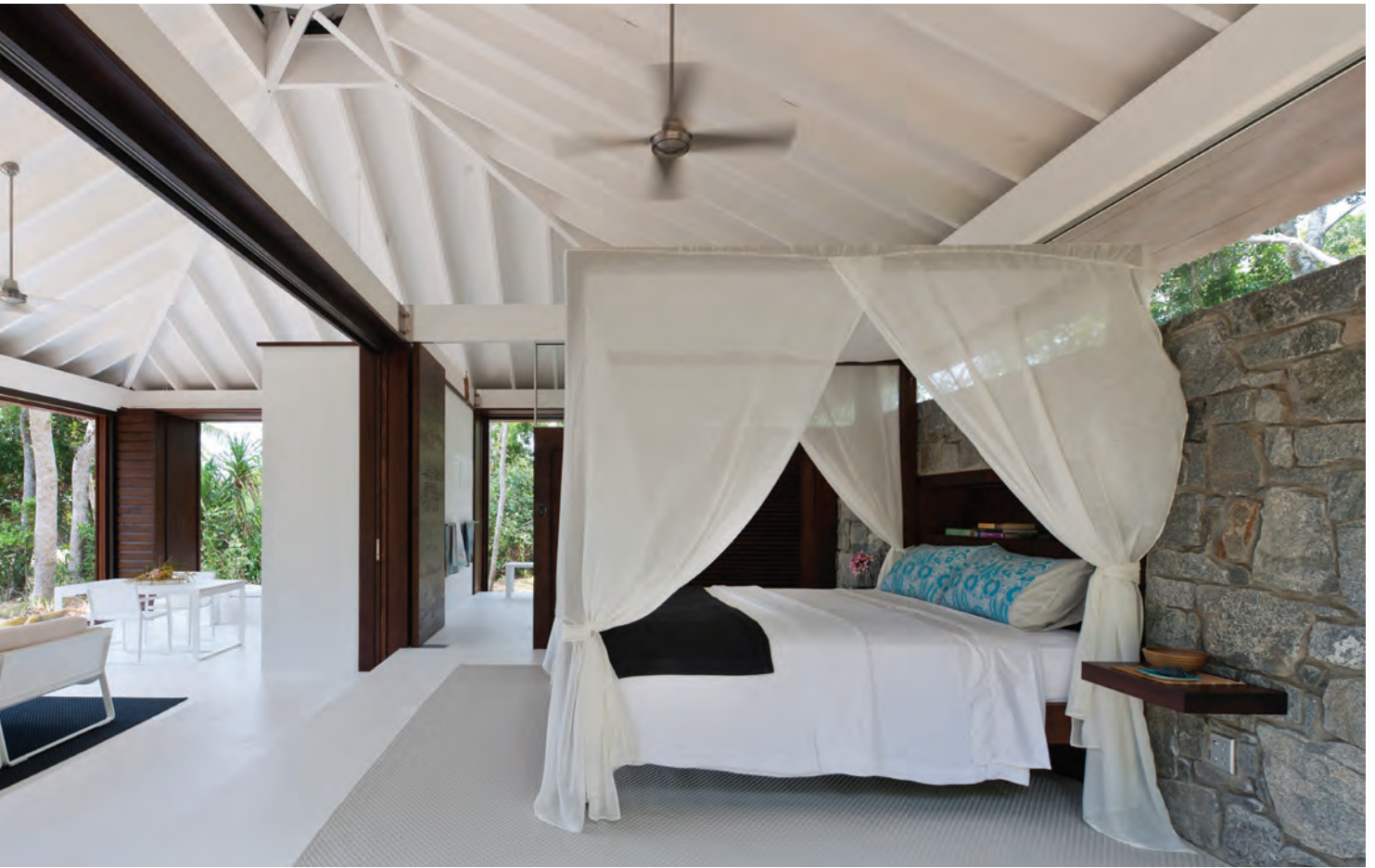
“The crisp white interior walls and concrete slab floor offer cool respite from the heat outside while nodding to the bleached white sands beyond”